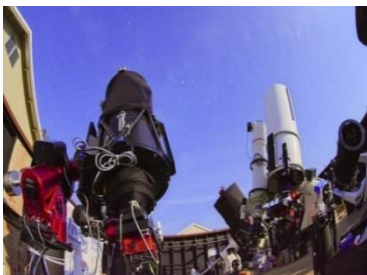
Above: Building 9: Opened for another night of Imaging

Video of Planewave installing a 0.7 meter CDK for NARIT (National Astronomical Research Institute of Thailand) at SRO: https://www.youtube.com/watch?v=Q0bTL_D_c1A