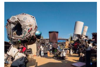
Building 9 at full capacity