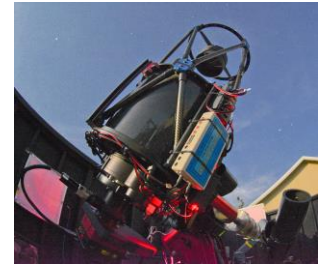
ExoAnalytic Solutions' 14 inch PlaneWave CDK