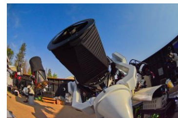
Dick Post's 24 inch Planewave on a Mathis mount.