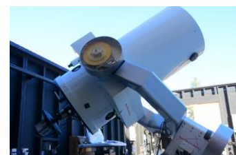
Korean Astronomy and Space Science Institute's 24" OGS