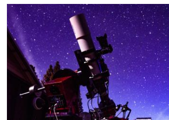
Samuel Lising's Starfire 130