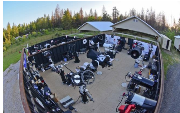
Building 9 and 10 Getting Ready For Another Night Of Imaging And Data Collection

For us at SRO there is nothing, not even our own astrophotography, which occupies more time and attention than improving our infrastructure. We believe SRO is environmentally unique, with 1 arcsecond summer seeing, great weather conditions (no summer monsoons), dark skies and average wind speeds of 1 mph. But for the remote imager and scientist, all this is meaningless if you can't easily and consistently access the site to run your telescope. Our philosophy has always been to continually improve each aspect of our infrastructure as new technology becomes available, investing in the best devices to monitor our seeing and weather and writing the specialized software needed to integrate everything properly. It's a matter of looking at our site as a series of replaceable parts and