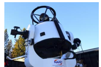
NARITs PlaneWave CDK 700