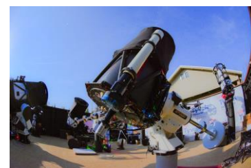
SOPHIA's 24 inch Officina Stellare on an Astro Physics GTO 3600